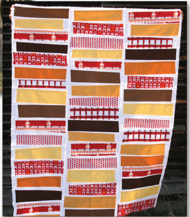
46-1/2" x 60"