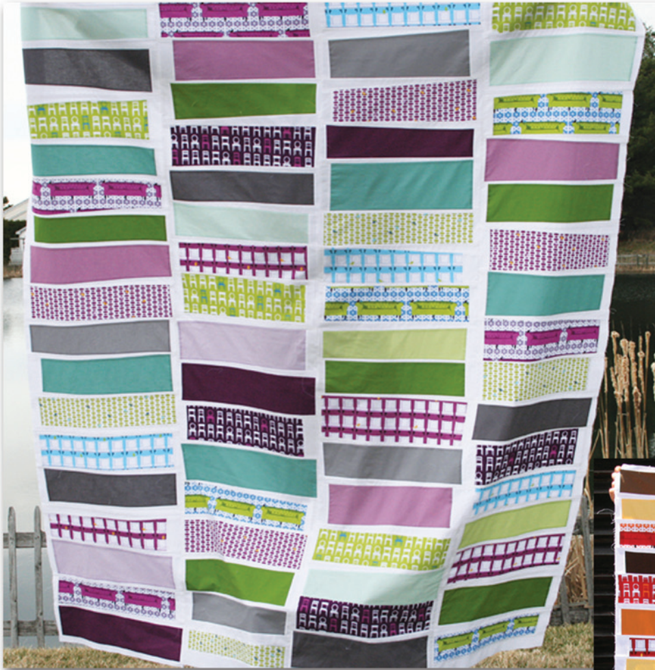
54" x 84"

featuring tufted tweets by Laurie Wisbrun